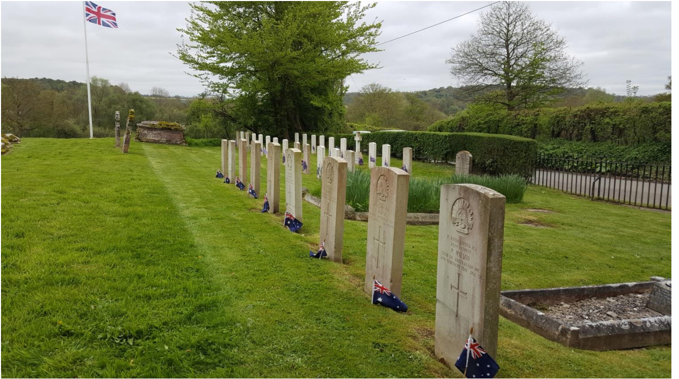
St. Edith's Churchyard, Baverstock