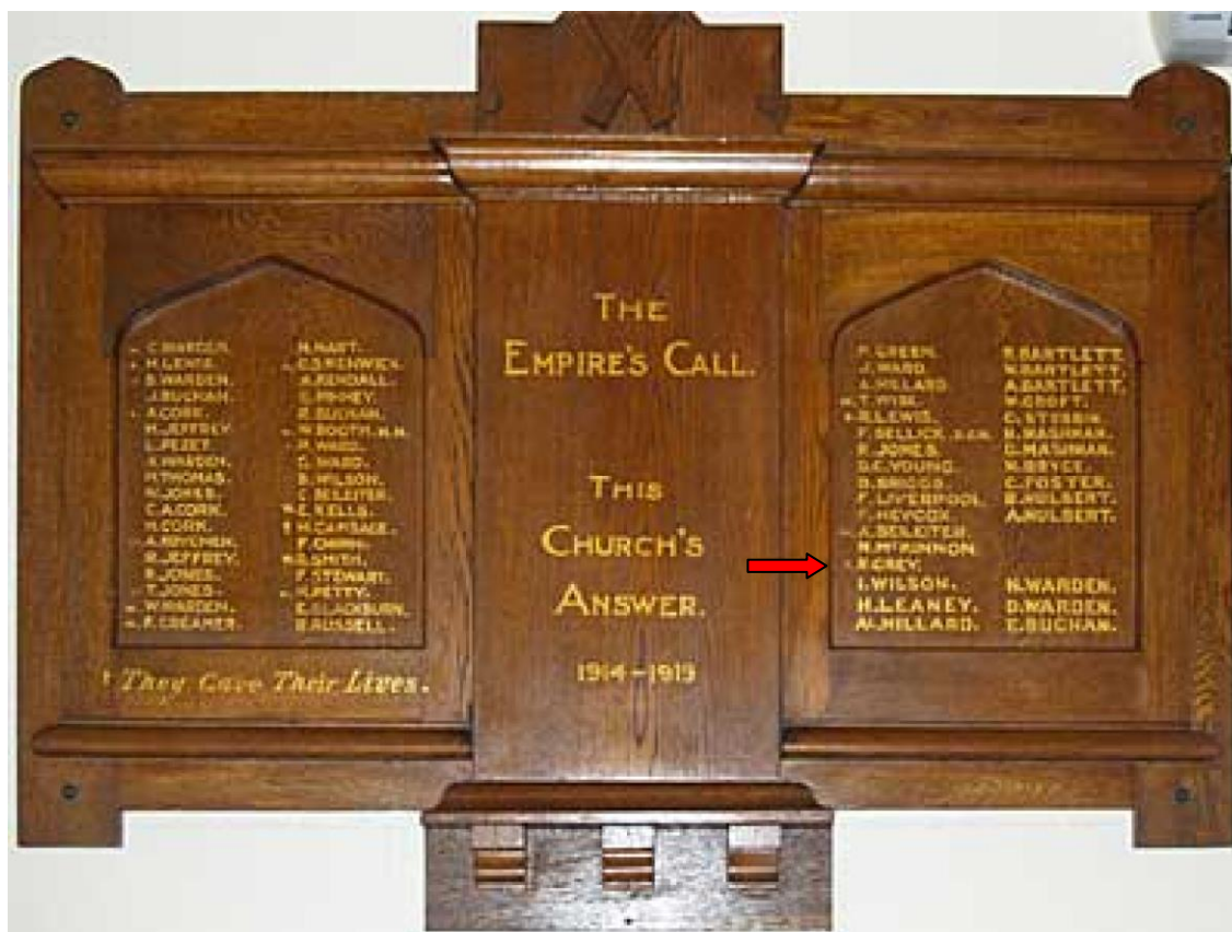
Honour Roll in St. Peter and St. Paul Anglican Church, Milton