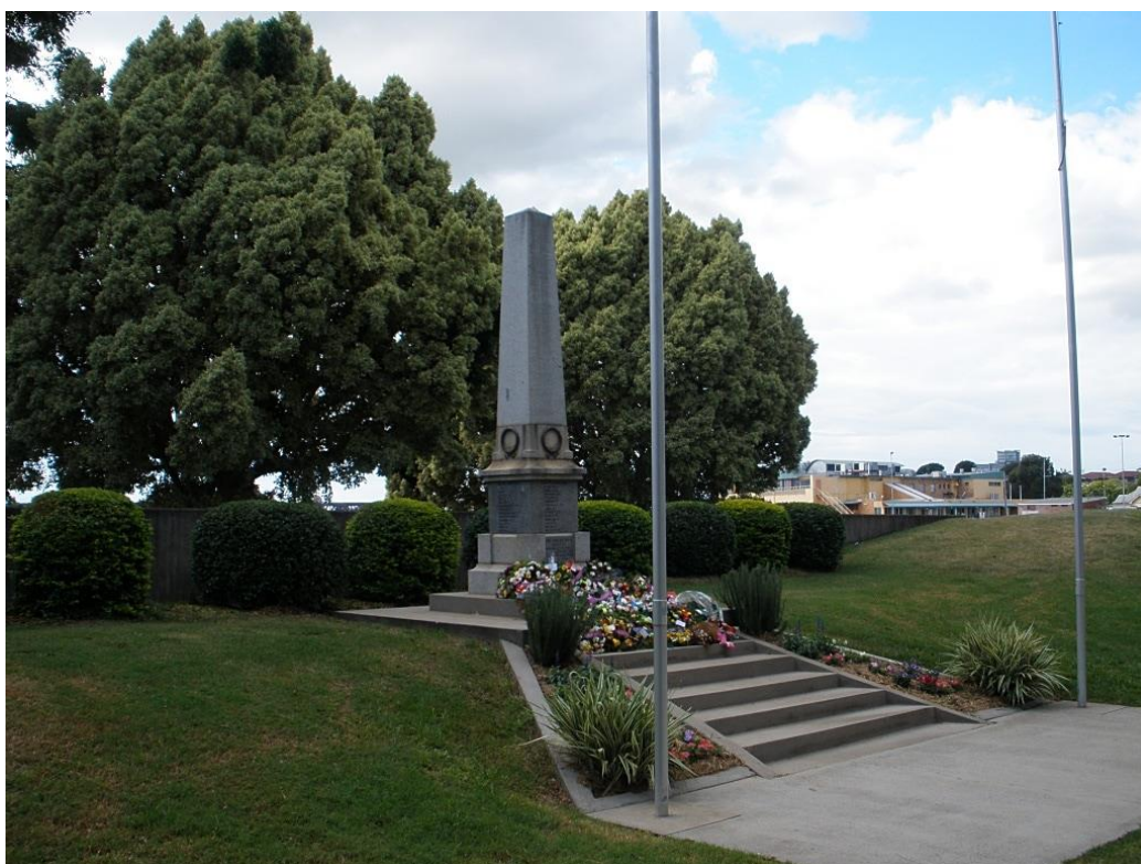
South Grafton Cenotaph